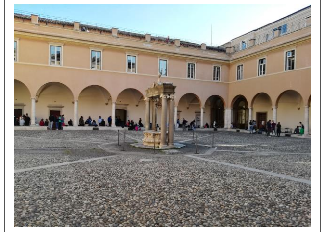
2 Faculty Cloister