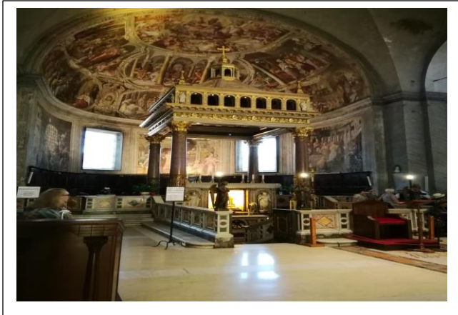
5 Church of San Pietro in Vincoli: Ciborium