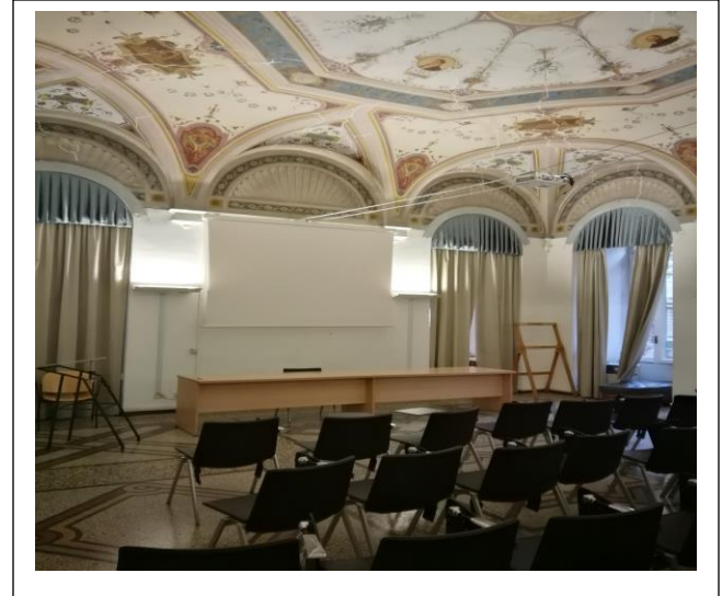
4 Cloister's "Affreschi" Room