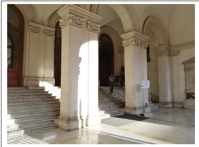
1 Faculty Main Entrance Hall