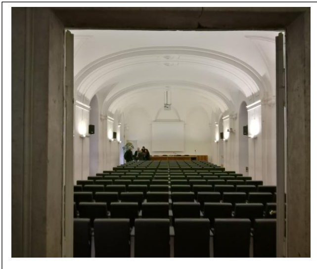
3 Cloister's Main Room