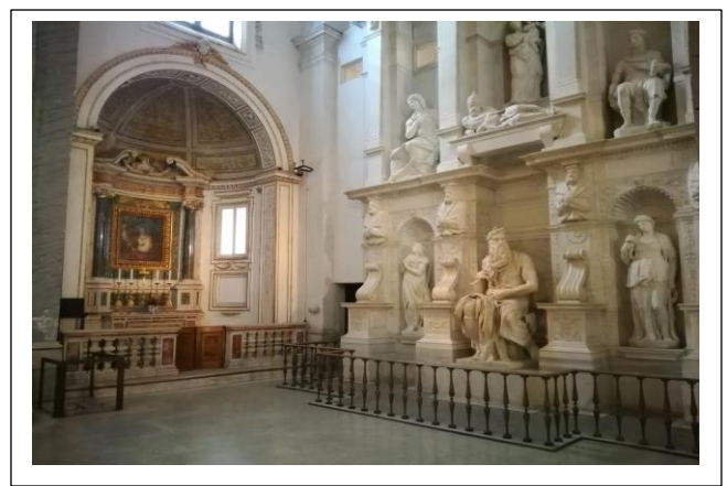
6 Church of San Pietro in Vincoli: Michelangelo's Moses